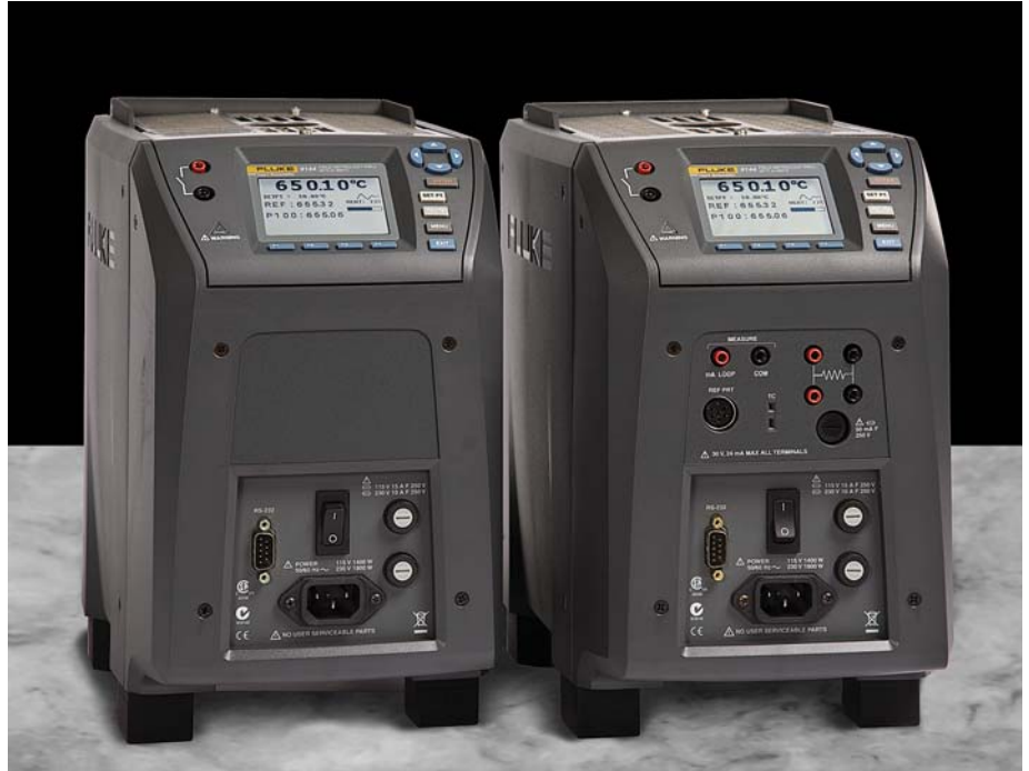
Field Metrology Wells are available in two versions for maximum speed and portability for the industrial environment. The standard version, pictured on the left, is our best field calibrator, and the process version, pictured on the right, is an all-in-one process calibration tool that reads electronic thermometers, automates calibration, and documents the results.

Never buy a temperature calibration tool from a company that only dabbles in metrology (or doesn't even know the word). Metrology Wells from Fluke are designed and manufactured by the same people who equip the calibration laboratories of the world's leading temperature scientists. These are the people around the world who decide what a Kelvin is! We know a thing or two more about temperature calibration than the vast majority of the world's dry-well suppliers. Yes, they can connect a piece of metal to a heater and a control sensor. But we invite you to compare all our specs against the few that they publish. (And by the way, we meet our specs!)